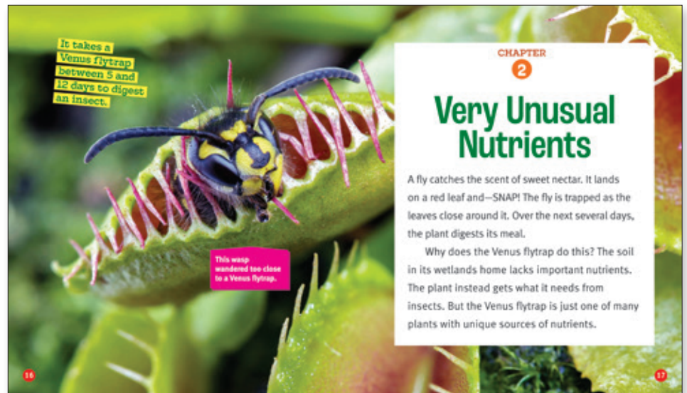
Sample spread from Crazy Plants